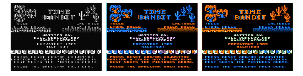
Figure 5.2: Time Bandit, Dunlevy & Lafnear, 1983 in different artefact modes

Try pressing Ctrl+A one or more times. What this really means is that you're used to running the program on an NTSC machine, and it makes use of cross-colour, but XRoar is emulating a PAL machine. Try starting with -default-machine tano or -default-machine cocous.